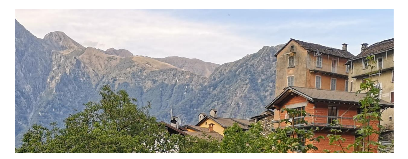
Workshop: Foster Young Life in Rural Areas (Part I: Gurro/Northern Italy), 29 July – 9 August, 2023

We were happy to spend 10 interesting days with participants from Italy, Austria, and Germany. We eased into the week by getting to know each other and our backgrounds and sharing our needs and wishes to create an inclusive space for the week to come. Playfully, we learned some phrases to interact in our respective mother tongues, we explored the soundscapes of the village whose inhabitants hosted us with open arms and enjoyed and explored the beautiful mountain landscape, e.g. traces of spazza caminos and former chestnut agriculture.